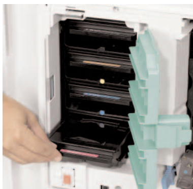
Easy-to-replace toner cartridges make routine maintenance a snap.