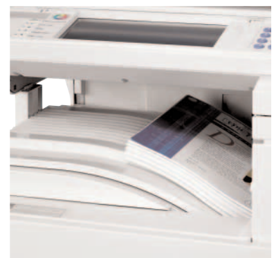
The Internal Shift Sort Tray option sorts and collates hardcopy output without the expense of a finisher.