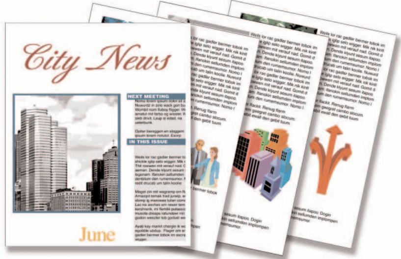
The DSc224/DSc232 make it easy to produce professional looking full color and black and white documents.