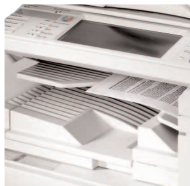
Incoming faxes can be automatically routed to a specified output tray.